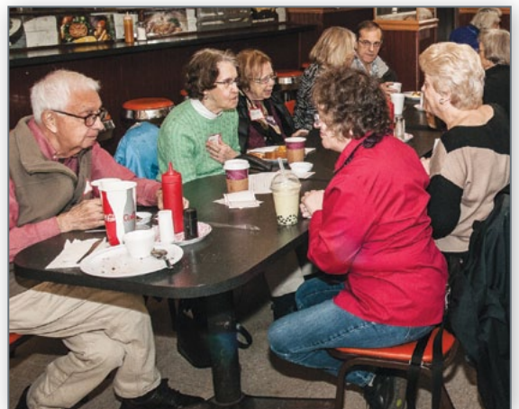
Monthly get-togethers at Brunch Bunch at the Olympia Café

Home Safety visits (MCFRS Senior Safety & Chevy Chase Village Police) Montgomery County Village Gathering (MC Village Coordinator) Guitar Master Class (The International Conservatory of Music)