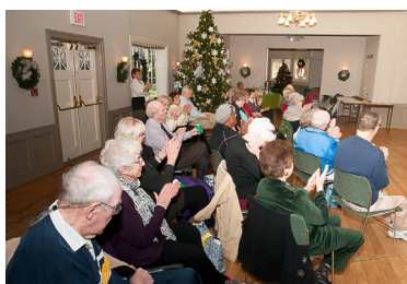
The Cookie Convention