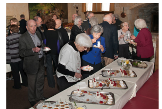
Member Appreciation Tea at La Ferme